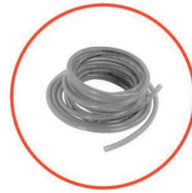
Hoses & Ropes