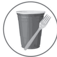
Cups, Lids, & Utensils