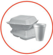
Styrofoam & Take-Out Containers

PUT THESE ITEMS IN THE TRASH ; DO NOT PUT THEM IN YOUR CURBSIDE RECYCLING: